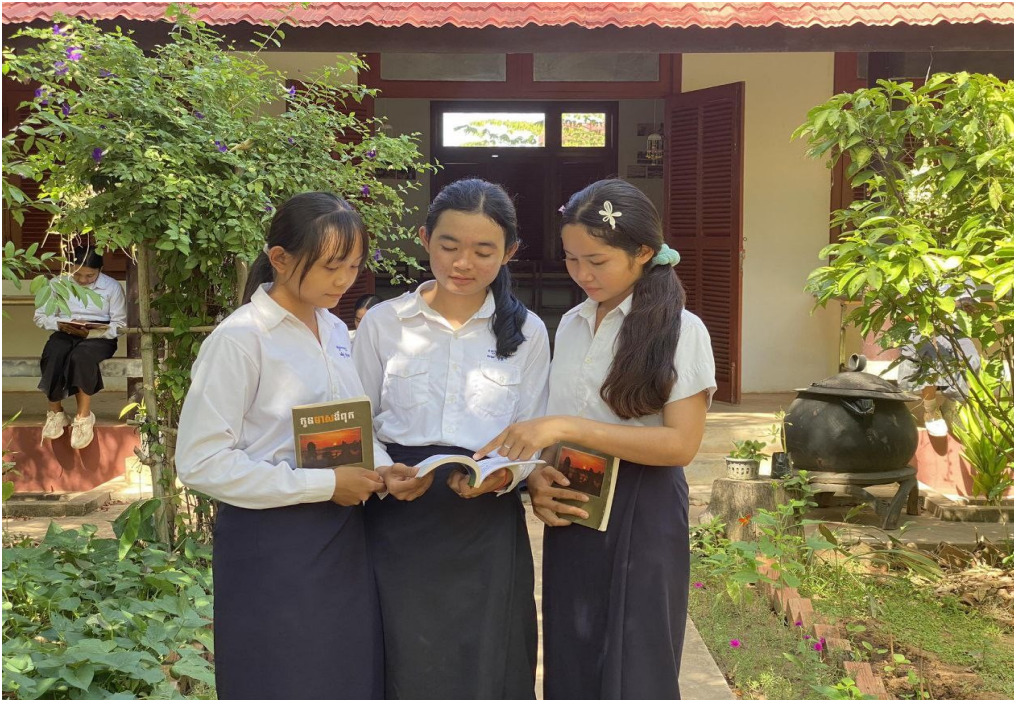
READING BOOKS IN PAGE LIBRARY