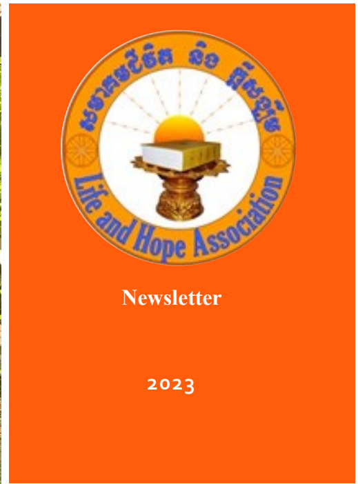
IN THIS NEWSLETTER