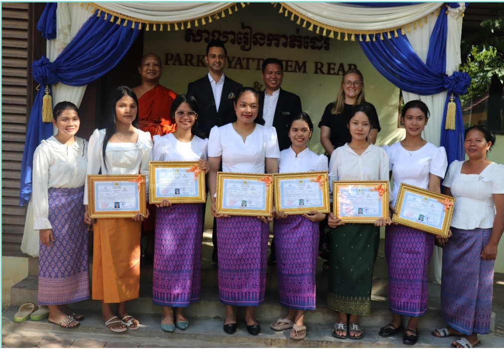
PARK HYATTSIEM REAP & LHA SEWING SCHOOL GRADUATION THE 17 TH PROMOTION